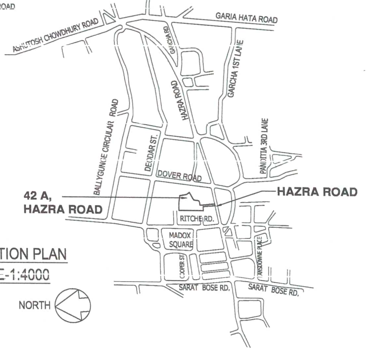
LOCATION PLAN SCALE-1:4000